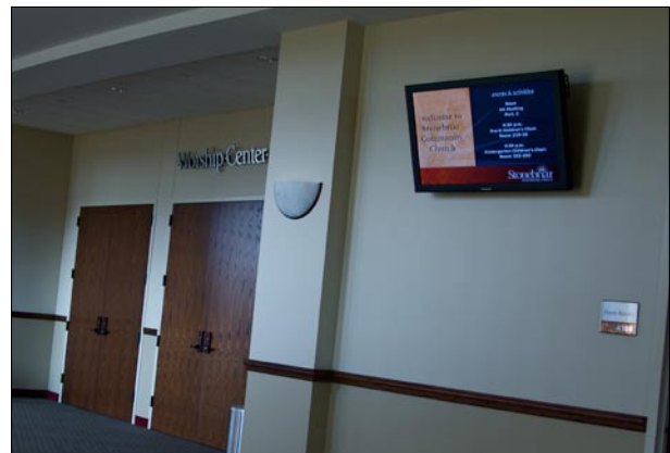
Strategic placement of plasmas puts information in high traffic areas.