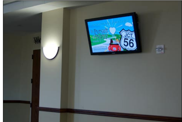
Content can be rotated based on a custom calendar of events and activities.

Stonebriar Community Church is thrilled with the solution provided by MMS. Across the campus Stonebriar can now provide a live video feed, scrolling announcements, dynamic updates of weather, class information, and other details to the congregation with the ease of use of a centralized system. The congregation can find the information it needs to make decisions on crowded Sunday mornings with highly visible and accurate information.