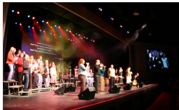
Image magnification and supporting graphics on three-screen projection system

The results for Crossroads Christian Church are beautiful I-Mag images during service with message-supporting graphics. The flexible, yet subtle system, allows the technical team to support the ministry staff in ways not available in the old venue, and allows the system to grow with minimal infrastructure cost.